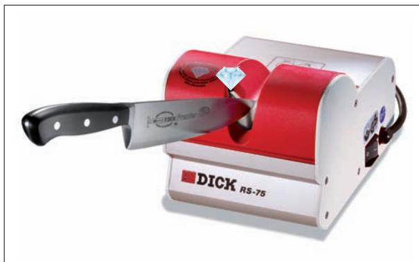
Sharpening Machine DICK RS-75

As leading knife manufacturer DICK is certainly competent regarding the sharpening of all types of knives. There are many different requirements for how a knife blade can be ground. DICK offers individual solutions e. g. for canteens and supermarkets: