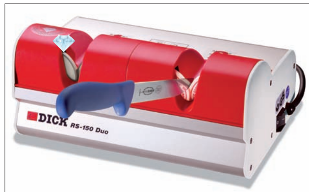
Sharpening and Honing Machine – for highest demands DICK RS-150 DUO

You can receive detailed information about our large range of Sharpening and Grinding Machines upon request.