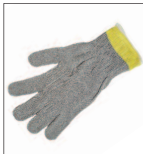
WD930 Cut Resistant Glove