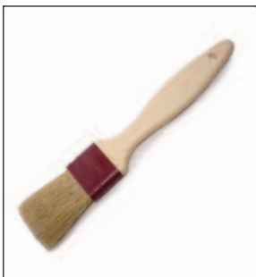
RE116012 Pastry Brush Natural 250mm