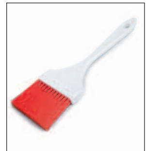
S82125 (75mm) S81125 (50mm) Glazing Brush 75mm