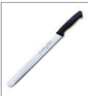
D8503830 12" Ham/Salmon Slicer