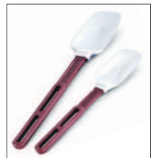
RE58110 (10") RE58123 (14") Hi Heat Spoon V