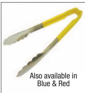
S053 Drua-cool Coloured Tongs Also available in Blue & Red