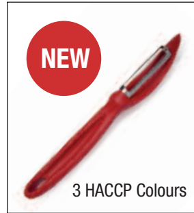
D8252200 Seratted Potato Peeler 3 HACCP Colours