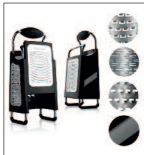
RM9434006 Microplane Sq. Grater