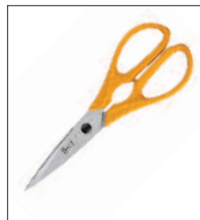
RPU979 Kitchen Scissors (colour coded)