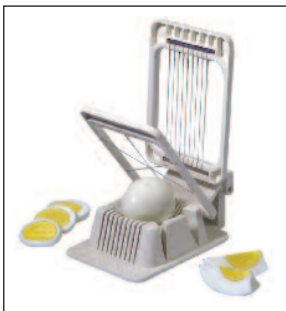
RE215306 Egg Slicer