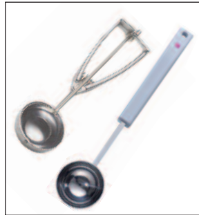
S086 Portion Scoop S086M Portion Scoop Plastic Handle