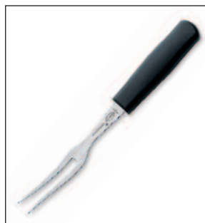
D9510117 7" Carvery Fork