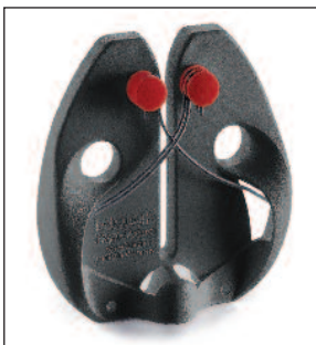
D9009100 Rapid Steel Action