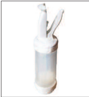
SJ500 FIFO Portion Control Kit