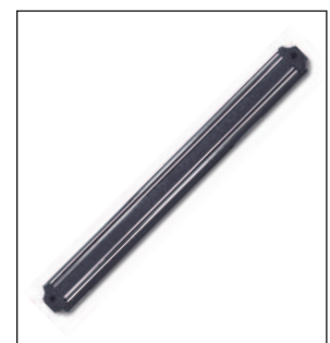
D9059155 (21.5") S700 (13") Magnetic Holder