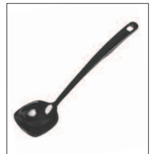
GT8008 (small 182mm) GT106 (medium 250mm) GT106 (large 310mm)