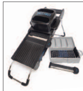
RJ200421 Black Plastic Mandolin