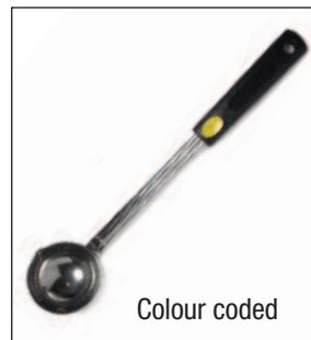
RF531 (Dressing Ladle) RF530 (Soup Ladle) Colour coded