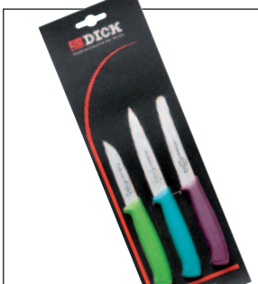
D8570009 Coloured Paring Knife Set