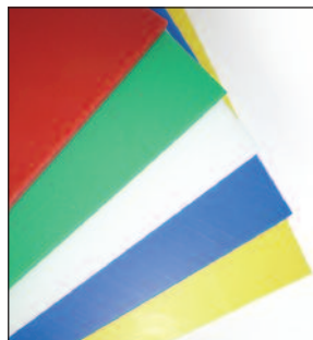
ICB12 12" x 18" Coloured Cutting Boards HACCP COLOURS