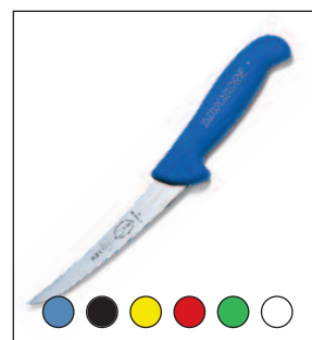
D8298115 6" Full-flexi Boning Knife