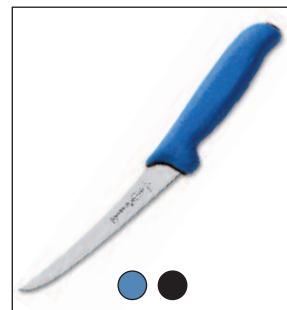
D8218115 6" Full-flexi Boning Knife