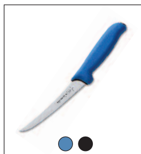
D8219113 5" Rigid Curved Boning Knife