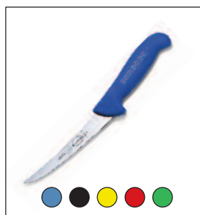
D8298213 5" Semi-flexi Boning Knife