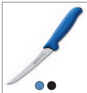
D8218215 6" Semi-flexi Boning Knife