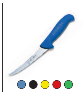
D8299113 5" Rigid Curved Boning Knife