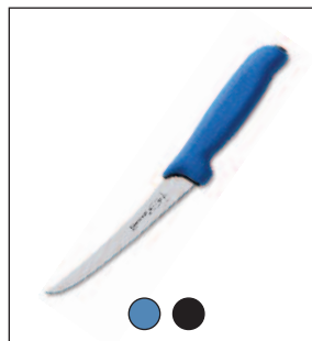
D8218113 5" Full-flexi Boning Knife