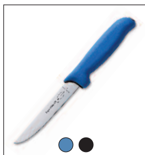
D8215915 6" Straight Boning Knife