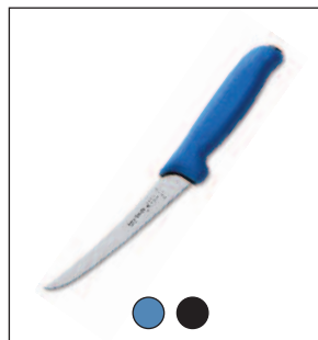
D8218213 5" Semi-flexi Boning Knife