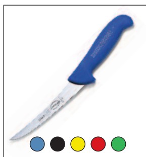
D8298215 6" Semi-flexi Boning Knife