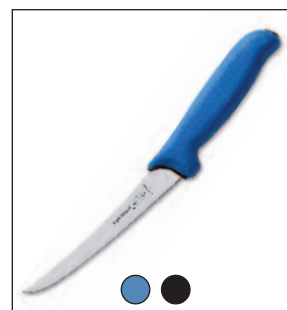
D8219115 6" Rigid Curved Boning Knife