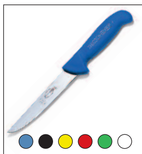
D8225915 6" Straight Boning Knife