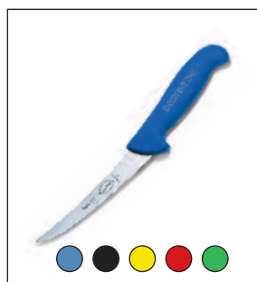
D8298113 5" Full-flexi Boning Knife