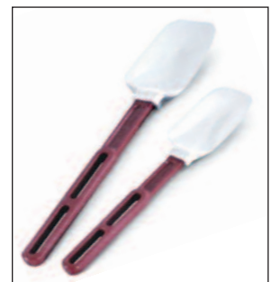
RE58110 (10") RE58123 (14") Hi Heat Spoon