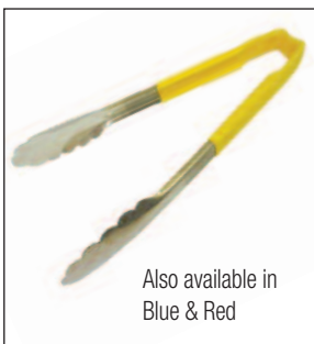
S053 Drua-cool Coloured Tongs