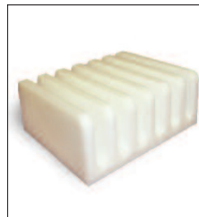
ICBR1 Cutting Board Rack 12mm