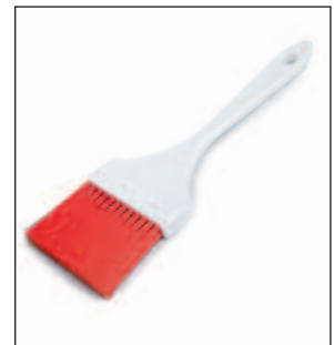
S82125 (75mm) Glazing Brush S81125 (50mm) Glazing Brush