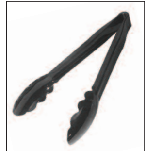
GT10 (no string) GT125S (with string) Plastic Tongs