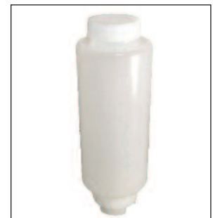
SJ16 Fifo Sauce Bottle 16oz SJ24 Fifo Sauce Bottle 24oz SJ32 Fifo Sauce Bottle 32oz