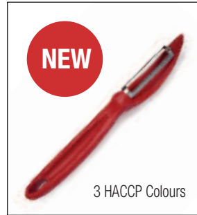
D8252200 Seratted Potato Peeler